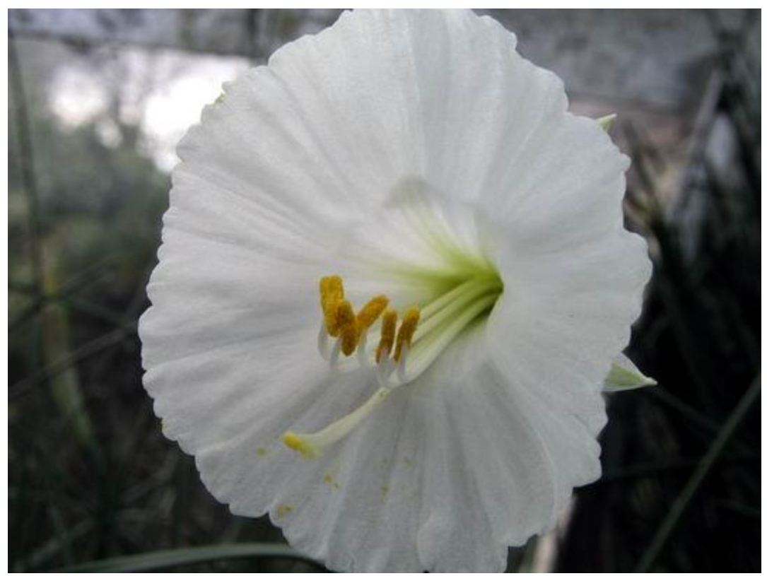
Narcissus romieuxii seedling

the plant is traceable, and people get to know. If I distribute a plant without a name and it increases well for others and they in turn distribute it, then somewhere along the line someone will give it a name and my worry is: what if two people along that chain of distribution decide to give it a different name? That is how we can get into confused mess with plant cultivar names and identification.