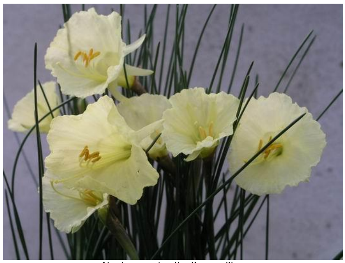
Narcissus romieuxii yellow seedling

As much as I try to cut back on the number of Narcissus we grow in pots I just cannot resist them, especially when some of our seedlings turn out like this one.