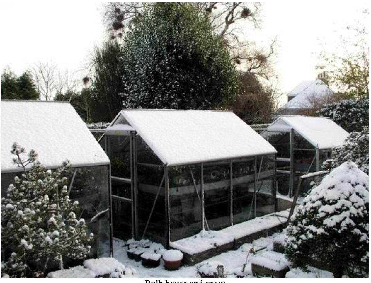
Bulb house and snow

The snow arrived again last Friday giving us that seasonal look a week too early for Christmas. I am not worried about leaving the snow on the glass roofs as long as it does not get too deep, if it does continue to snow then I would scrape it off as the build up of weight can cause these flimsy aluminium structures to collapse. The snow does cut down the light to the bulbs but as the temperatures are usually close to freezing. they are not inclined to grow anyway.