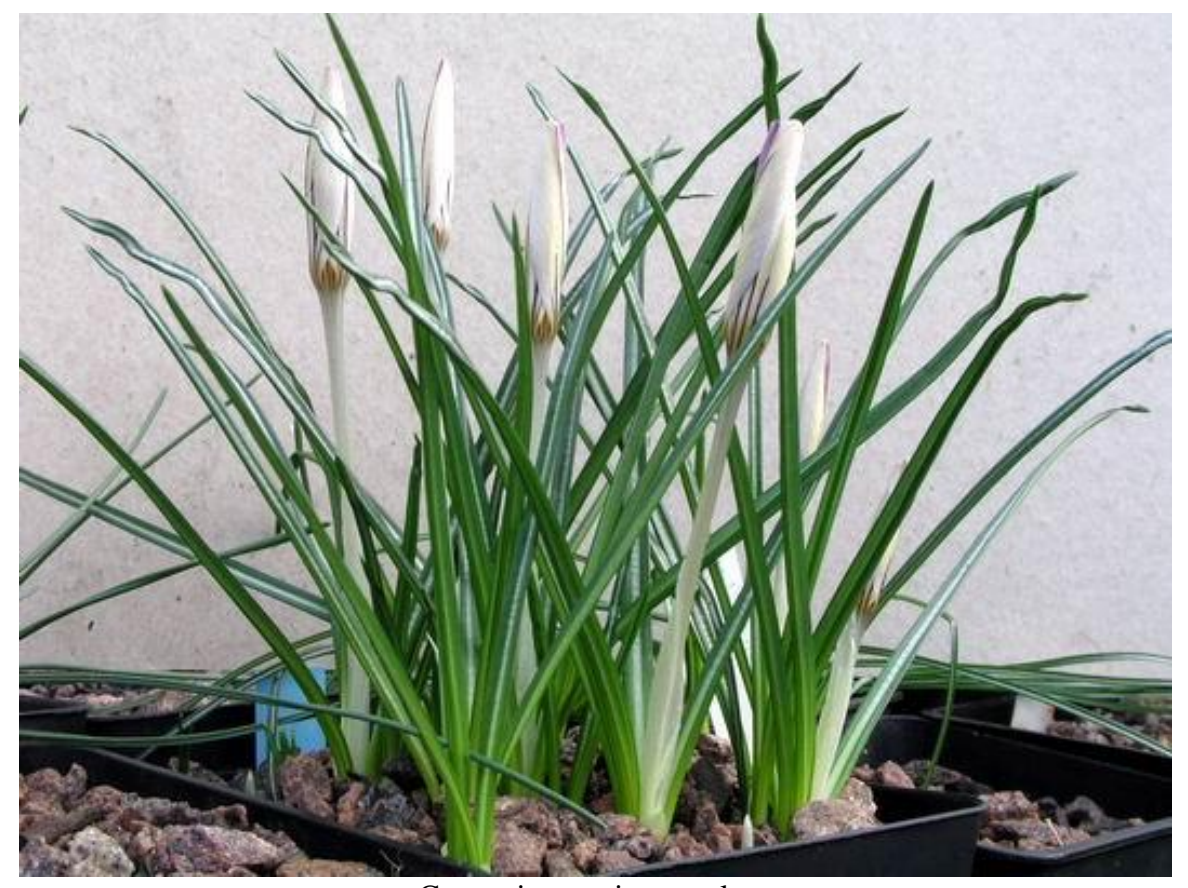
Crocus imperati suaveolens

Crocus imperati suaveolens is flowering well ahead of its normal time, I never remember it being this far advanced in December before. I am always surprised by the flowers, which are not very colourful when in closed bud like this, but have a strong and attractive colour when they are fully open. I also notice that many of the leaves on this form have a kink in them towards the end – this occurs every year and I wonder if it is typical of this species or if it is just this clone that I am growing, or is it a reaction to the growing conditions?