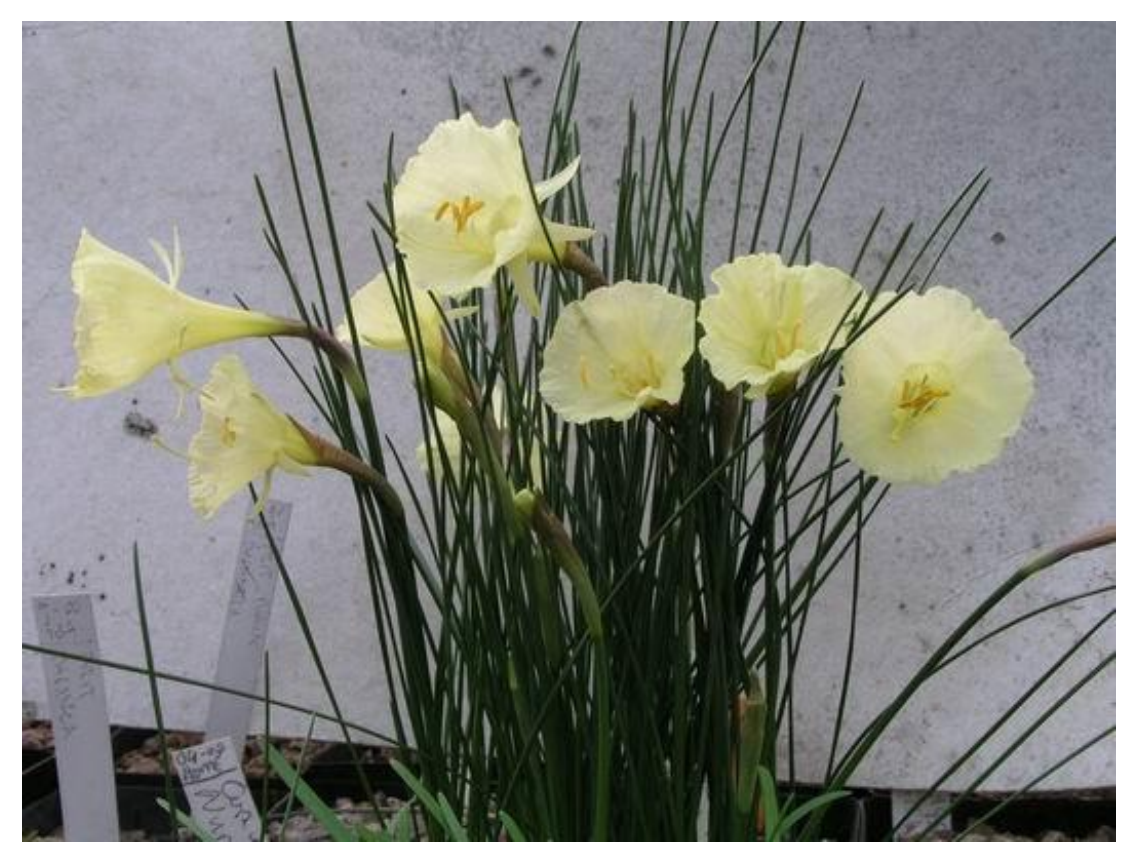
Narcissus romieuxii yellow

As much as I try to cut back on the number of Narcissus we grow in pots I just cannot resist them, especially when some of our seedlings turn out like this one.