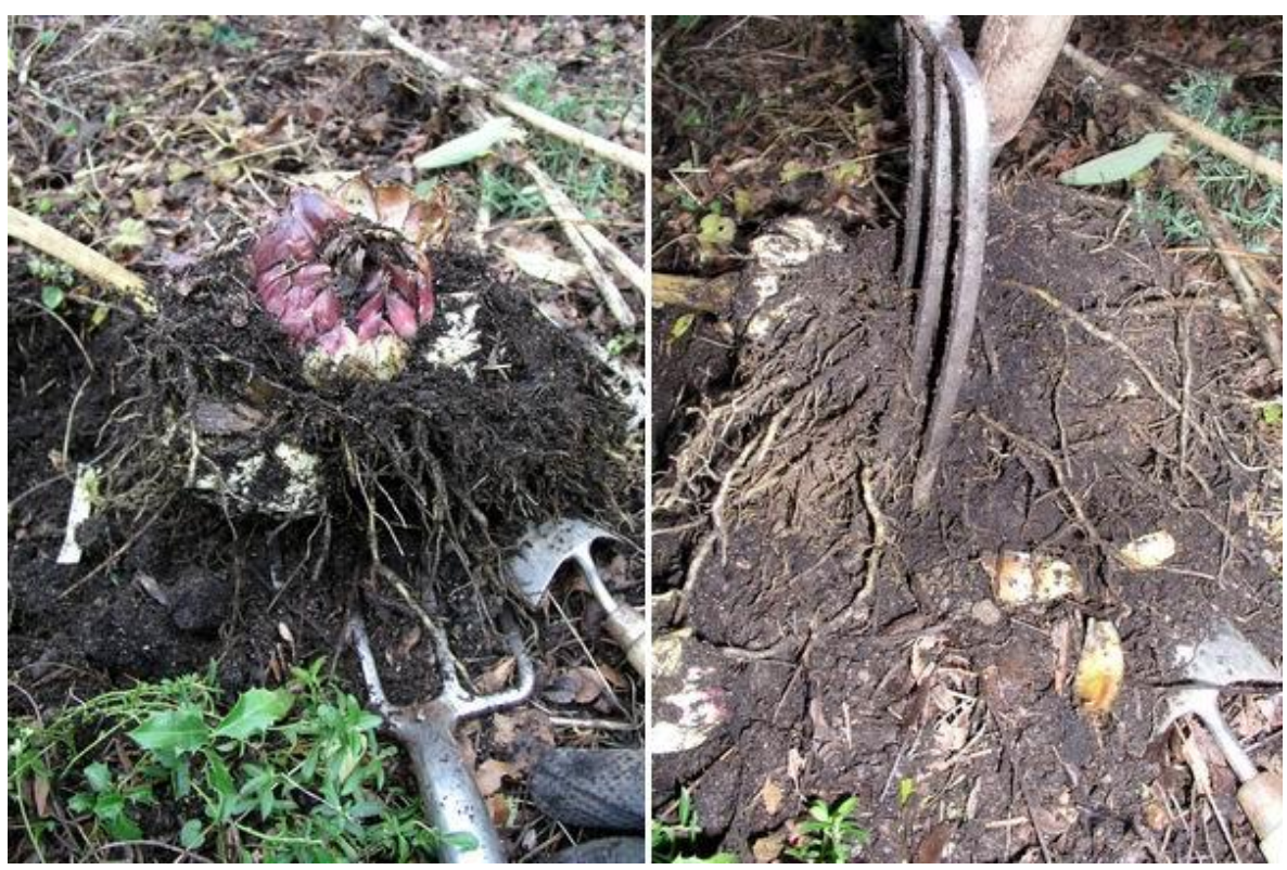
Splitting lily bulb

Just to show how temptation is always there, here is another seedling raised from Narcisus 'Camoro', which is a fertile hybrid between N cantabricus monophylus and N. romieuxii. While the flowers of 'Camoro' are an off white, this seedling has that sparkling crystalline white corona which is widely flared at the mouth – I am now waiting to see how well it will increase and if it will flower as freely as its seed parent. I should add that I have no idea what the pollen parent is, it could have selfed or it may have been crossed to another form. I am sure that you can see the dilemma that I am in; how can I cut back when all these lovely new seedlings keep appearing.