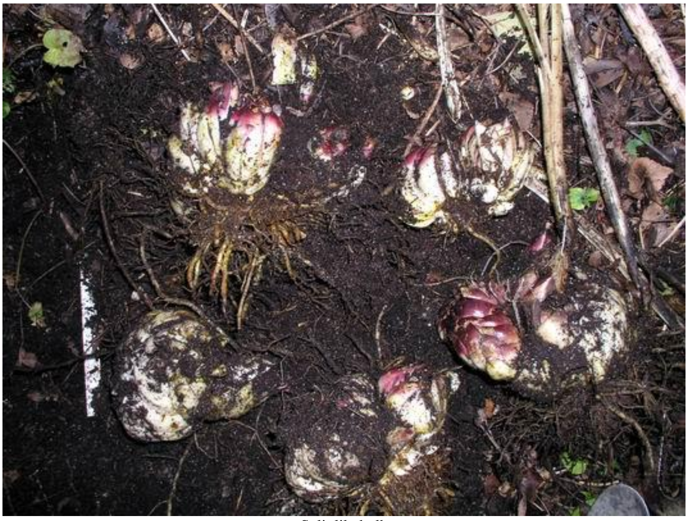
Split lily bulb

When I lifted it, I discovered that what was a single bulb when it was planted had now increased to a tangled mass of 10 bulbs.